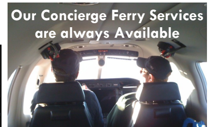
Our Concierge Ferry Services are always Available