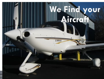
We Find your Aircraft

Done right, without the hassle? We do that. As your complete aircraft broker we take care of it all.