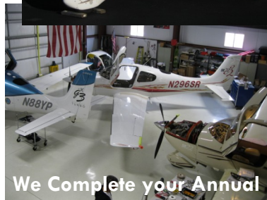
We Complete your Annual