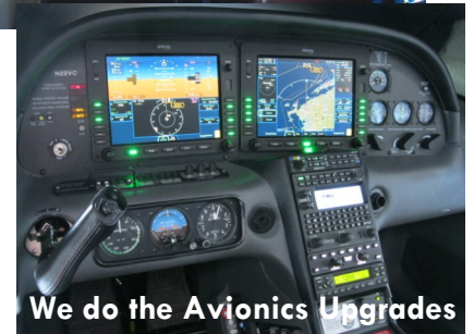
We do the Avionics Upgrades