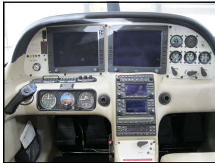
Cirrus SR-22 Before and After Pictures:

$70 w/o electricity $75 with electricity Call: 508-339-7077